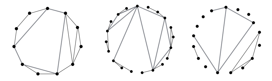
Fig. 2: Left: a dissection consisting of a root face (in gray) with an arbitrary dissection glued at each non-root edge. Center: the root of the connected graph belongs to three blocks (in gray); to any other vertex of these blocks there are two connected graphs attached, possibly reduced to a single vertex. Right: between every two consecutive vertices of the root component (in gray) there is an arbitrary graph, possibly empty. In all three cases the root is the vertex on top.